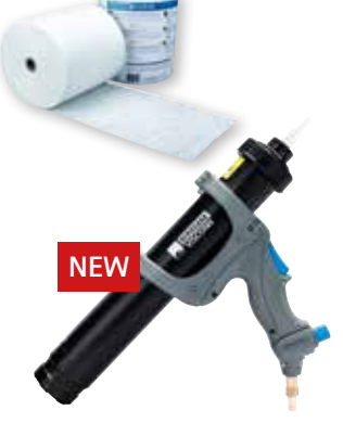
AEROFIXX Application tool for tubular bags within the AEROSANA system