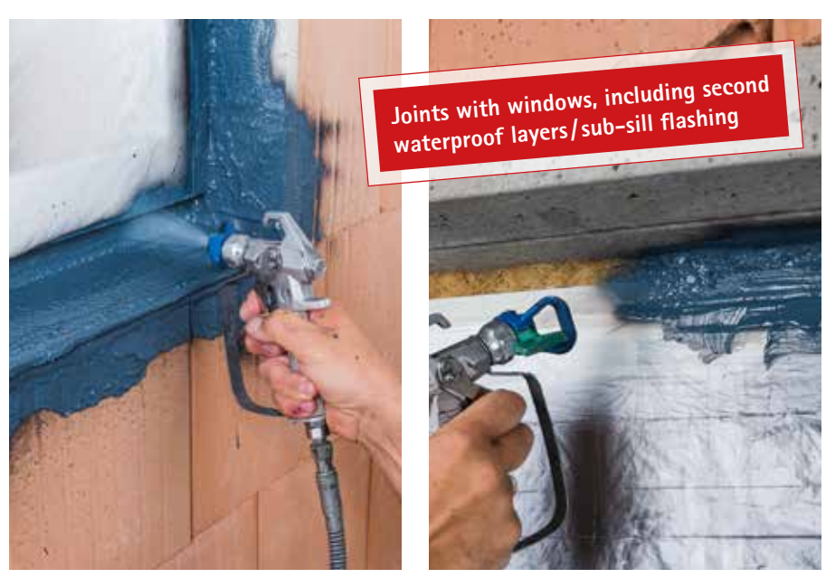
Creation of airtight interior airtight joints and exterior joints that are resistant to driving rain, using either a painting or spraying procedure. Can be used flexibly on fibrous insulation materials (e.g. hemp wool or sheep wool) and on spray foam. Interior and exterior joints tested and confirmed in accordance with the IFT Guideline MO-01/1:2007-01, Section 5.

Sprayable window joints: tested and approved