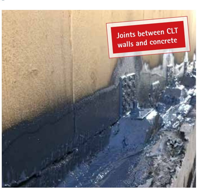
Airtight transitions between CLT elements and concrete slabs, for example, including difficult geometries (e.g. brackets). The surface layers of the elements must be airtight for this to work. Swelling mortar can easily be covered over.