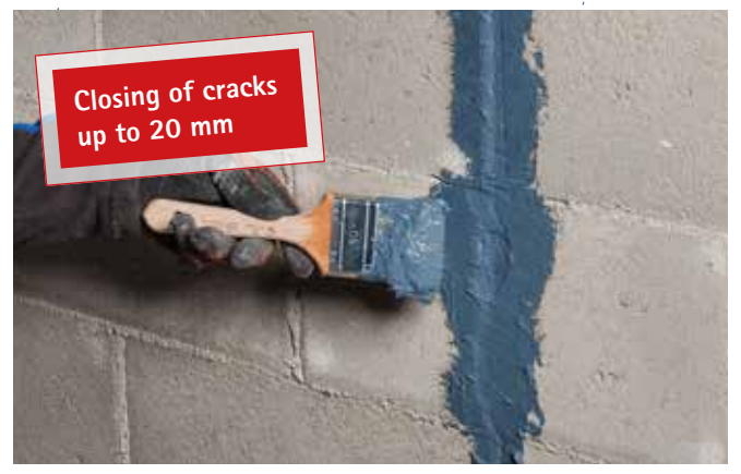
Wide cracks can be made airtight in an easy, time-saving manner using the AEROSANA VISCONN FIBRE brush-on sealant – using either a painting or spraying procedure (AEROFIXX).