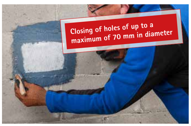
If there are large pieces broken out of the subsurface, simply combine AEROSANA VISCONN with AEROSANA FLEECE.