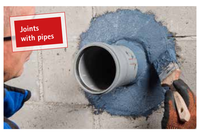
Seal joints with round penetrations - e.g. pipes - using AEROSANA VISCONN and AEROSANA FLEECE.

Watch the video AEROSANA VISCONN is extremely versatile!