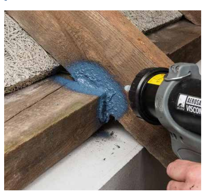
Simple airtight sealing of penetrations e.g. collar ties or rafters when carrying out roof refurbishment from the outside.