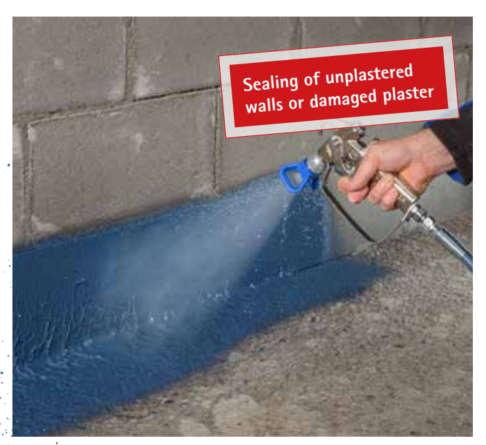
Creation of airtightness for unplastered masonry.