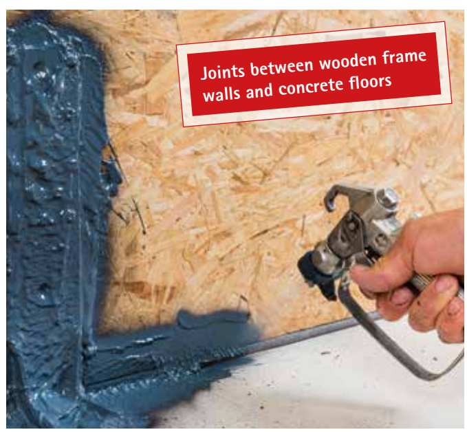
Airtight transitions between wood-based panels (e.g. OSB) and concrete slabs, for example. Swelling mortar can easily be covered over. It is easy to spray over difficult geometries (e.g. fastening fittings such as brackets). Durability has been tested and confirmed based on DIN EN 13984.